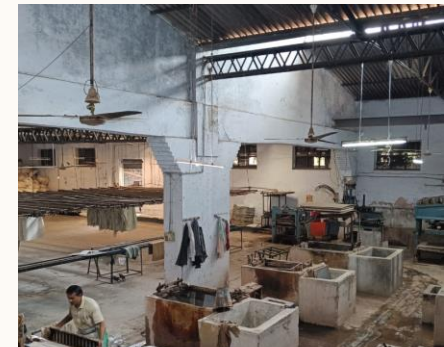
GLIMPSE OF THE FACTORY