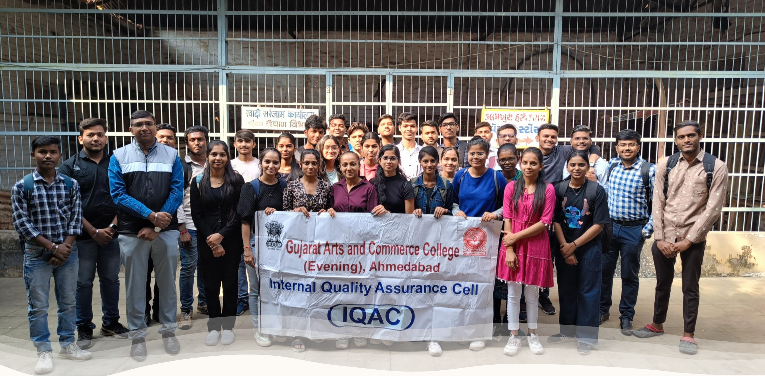
Kalamkhush visit : 14-12-23 – 32 students and 3 faculties