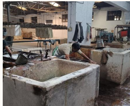
FACTORY STAFF INVOLVED IN PRODUCTION PROCESS