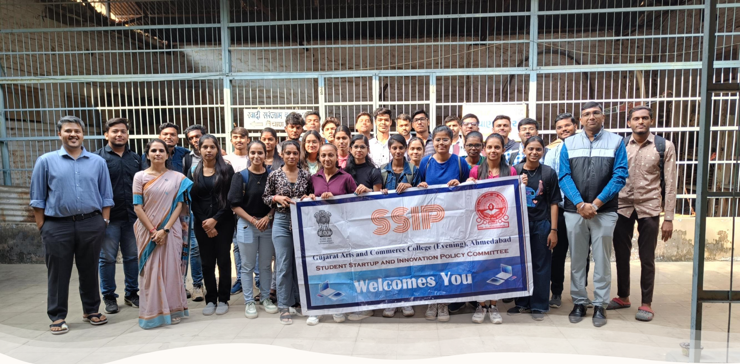
Kalamkhush visit : 14-12-23 – 32 students and 3 faculties