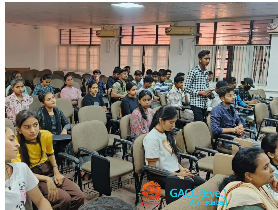
College students engrossed in the sessions