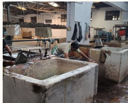
FACTORY STAFF INVOLVED IN PRODUCTION PROCESS