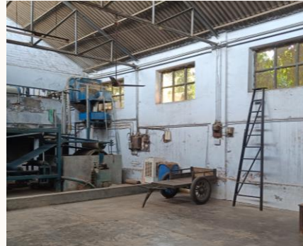
GLIMPSE OF THE FACTORY