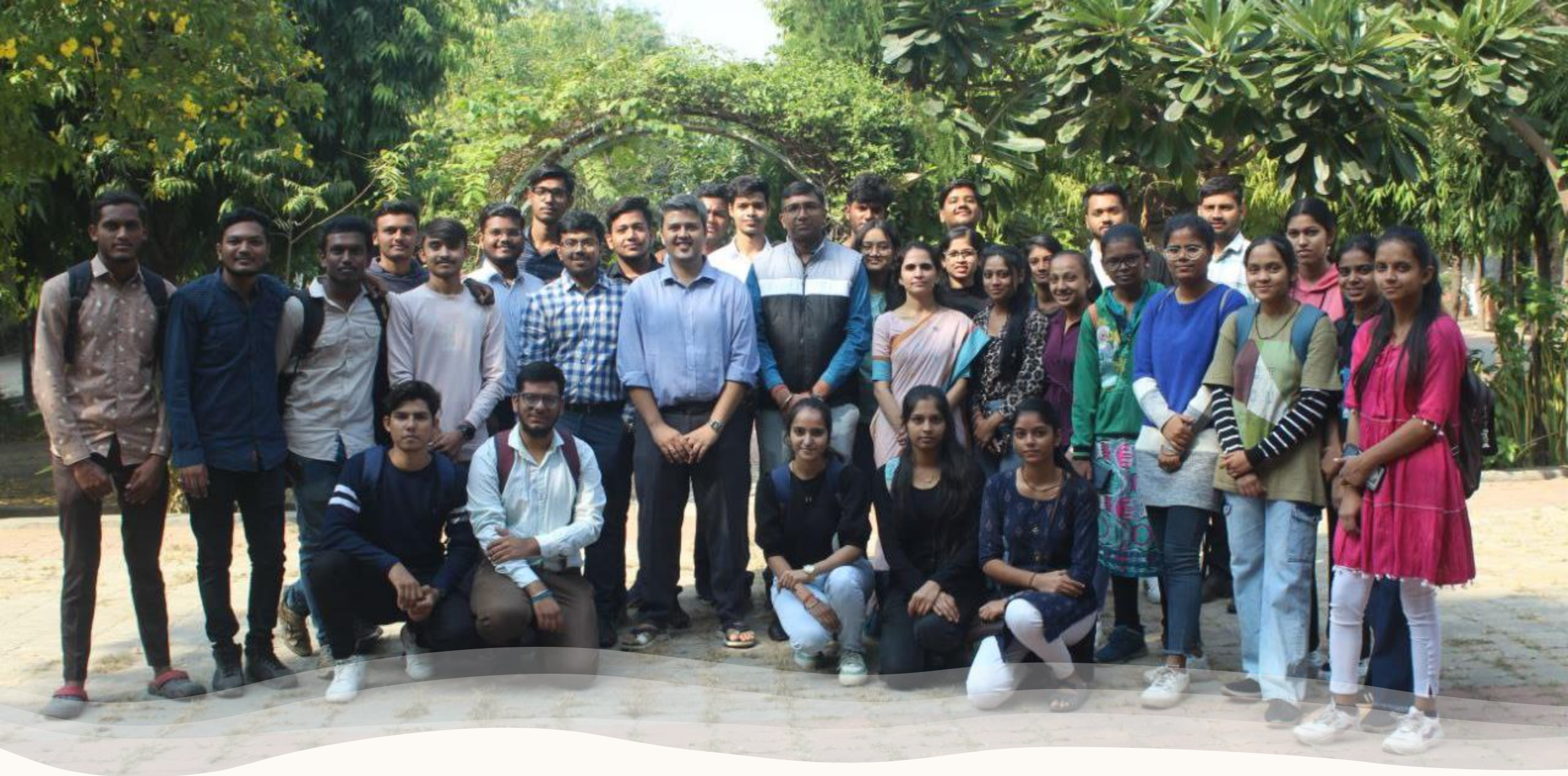
Kalamkhush visit : 14-12-23 – 32 students and 3 faculties