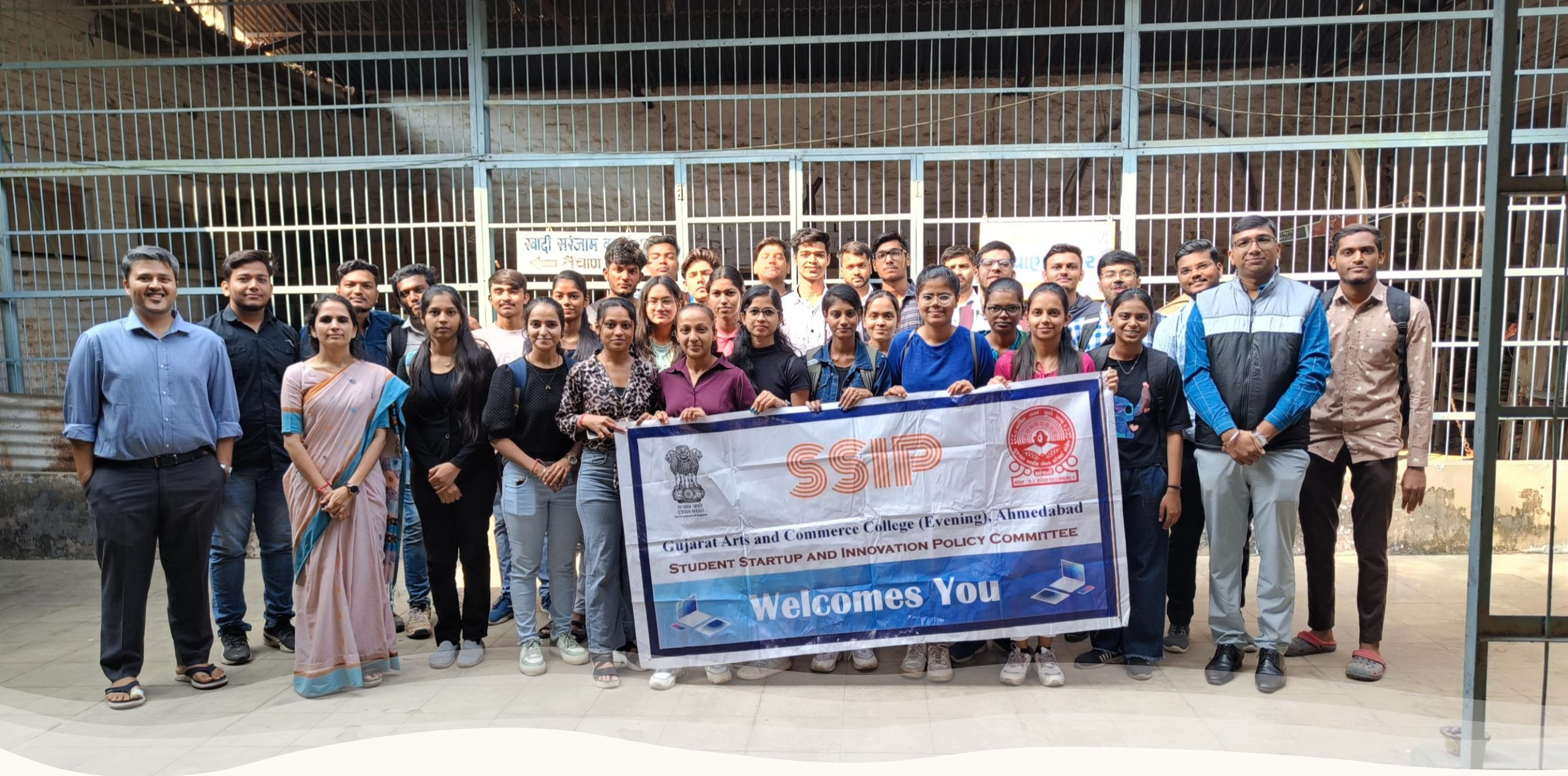
Kalamkhush visit : 14-12-23 – 32 students and 3 faculties