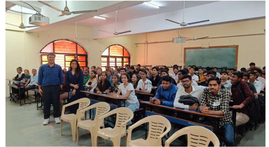
Startup Shaala Event 3 - 20/12/23