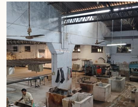
GLIMPSE OF THE FACTORY