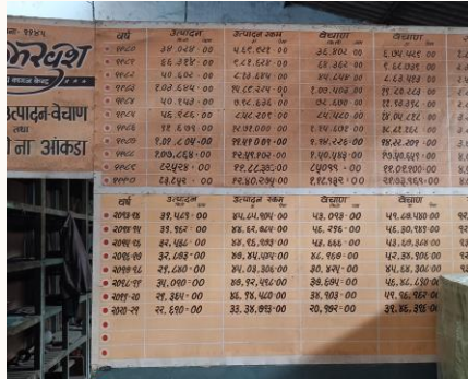
NOTICE BOARD SHOWING THE FINANCIALS OF THE UNIT SINCE INCEPTION