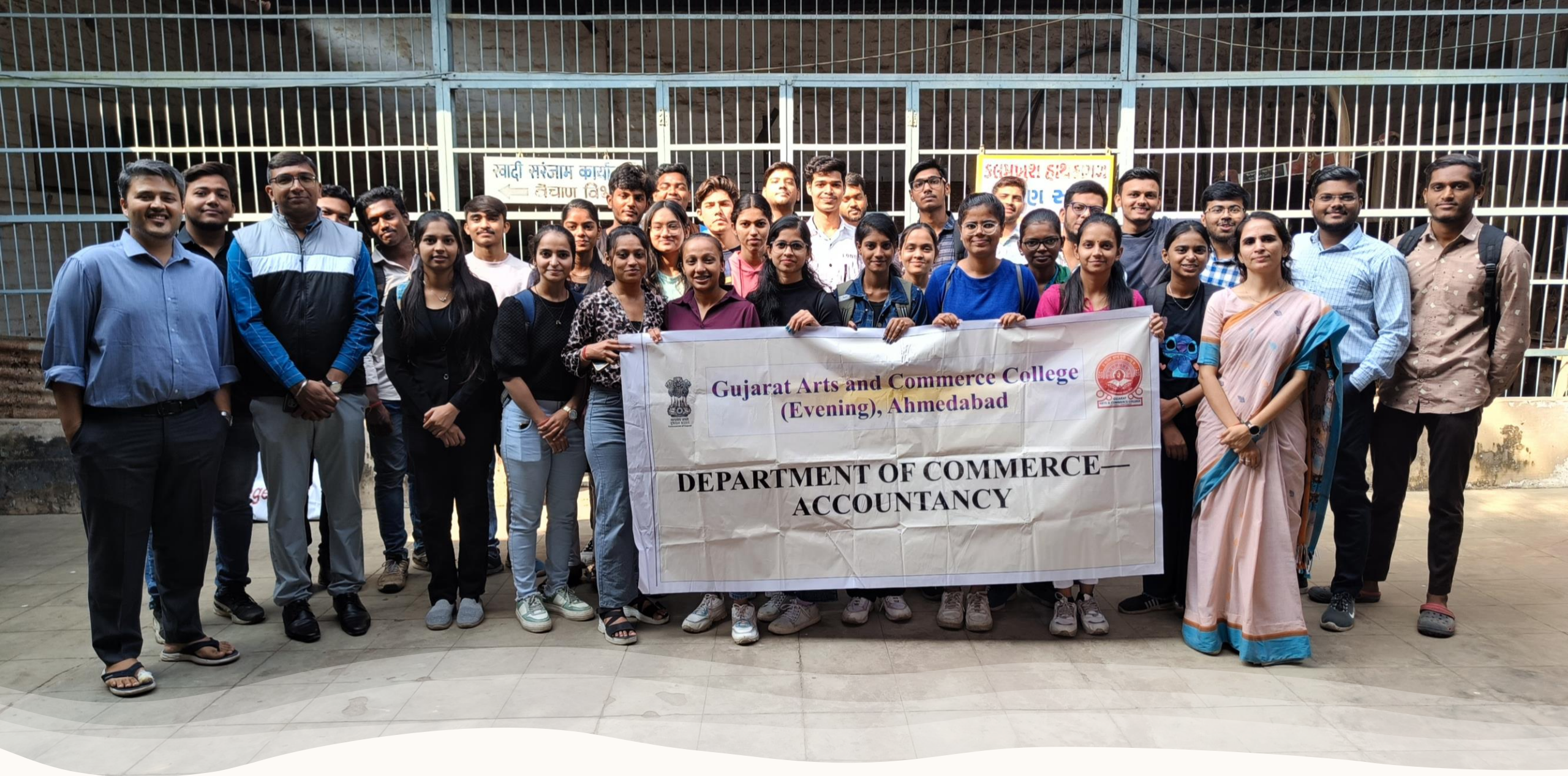
Kalamkhush visit : 14-12-23 – 32 students and 3 faculties