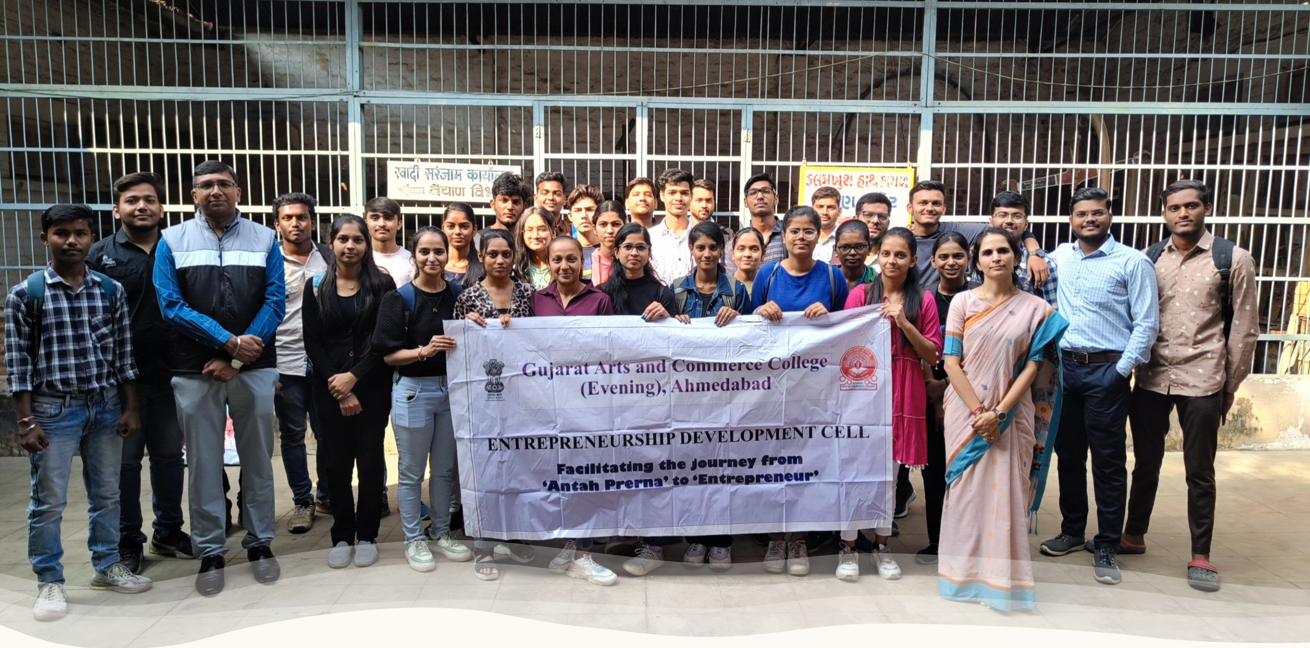
Kalamkhush visit : 14-12-23 – 32 students and 3 faculties