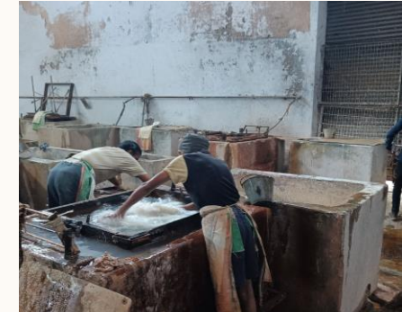
FACTORY STAFF INVOLVED IN PRODUCTION PROCESS