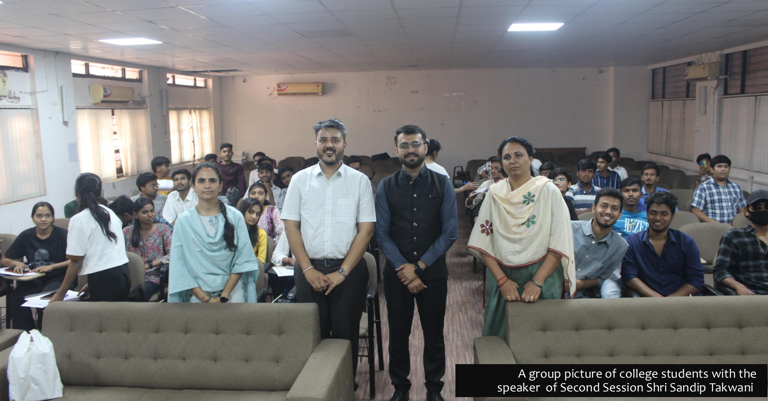
A group picture of college students with the speaker of Second Session Shri Sandip Takwani