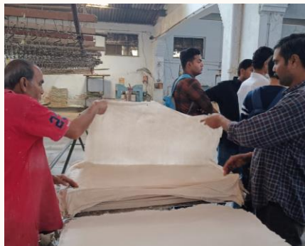
FACTORY STAFF INVOLVED IN PRODUCTION PROCESS