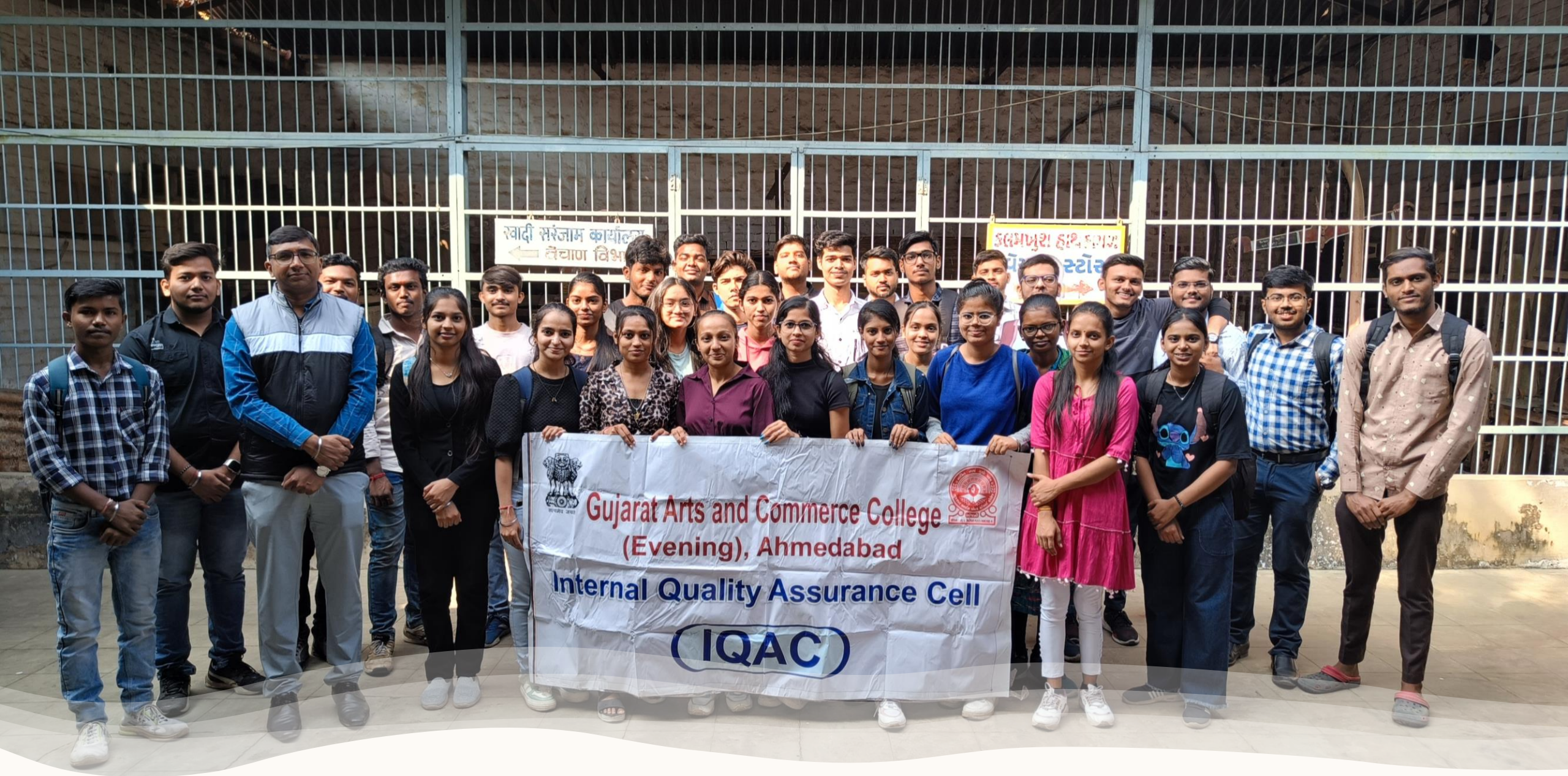
Kalamkhush visit : 14-12-23 – 32 students and 3 faculties